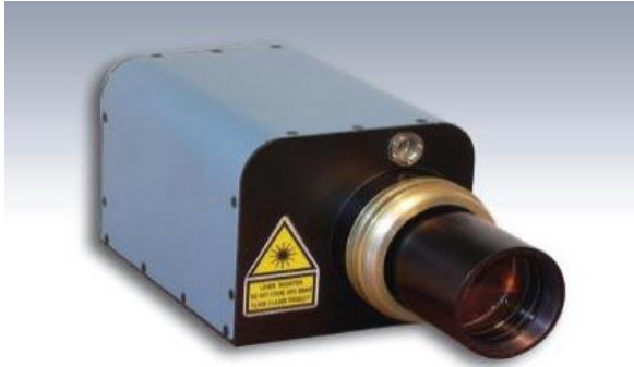
Aluminum Profile Sensor with scanner